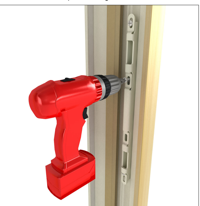
Figure 4 Fasten the new keeper. Refer to the product's installation instructions for more details on handle installation.

4. Install the remaining screws in the middle two slots of the new keeper. See figure 4.