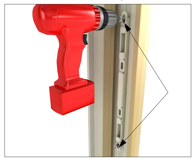
Figure 2 Fasten the new keeper by lining up the existing top and bottom screw slots.

2. Install the new keeper. Center the top and bottom screw slots to the existing top and bottom holes and fasten with screws. See figure 2.