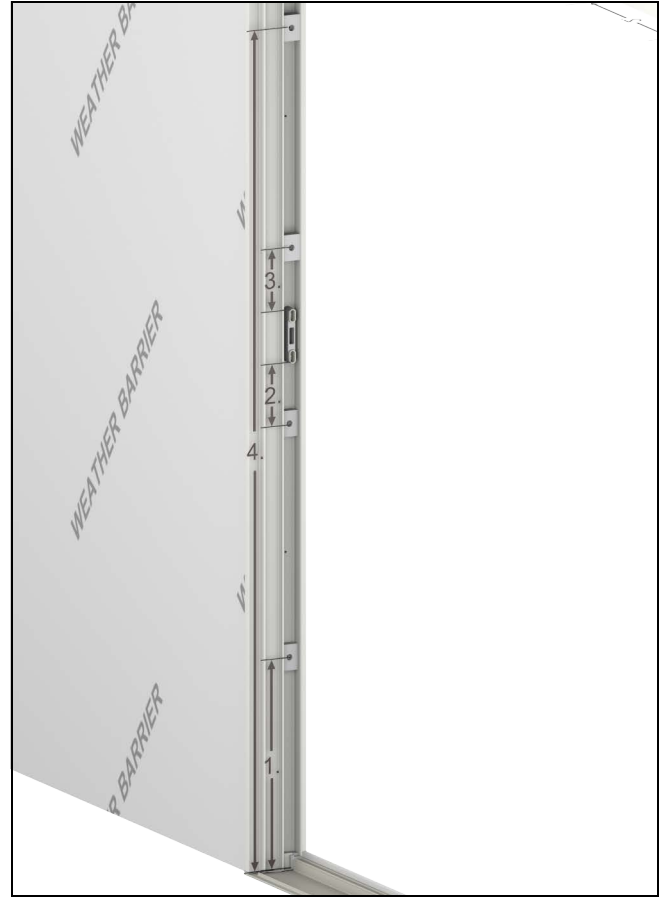
Figure 3 Block Placement for Operator Jambs.