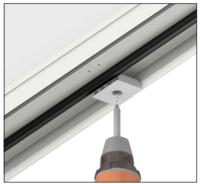
Figure 5 Secure blocks through head jambs with 5/8" screws.