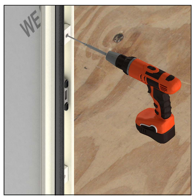
Figure 4 Secure blocks through jambs with 3" screws.

4. Secure all the jamb blocks with the supplied installation screws, using the 3" screws in the operator jamb and the 5/8" screws in the head jamb. See Figure 4 and Figure 5.