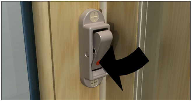
Figure 6 Press the red dot "in" to bypass the control device and fully open the window.

NOTE: When following the template correctly, the window will have an opening height of 4" (102) with the standard sill liner. In order to regain full operation of the window, press the flipper until it rests in the bypass position. Operate the sash like normal. See figures 6 and 7.