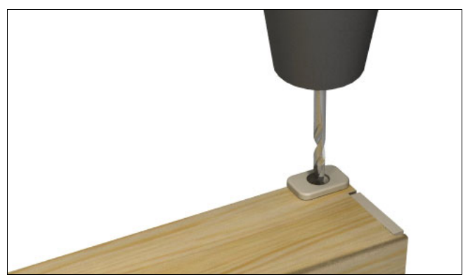
Figure 4 Bottom sash shown.

1. Using the strike as a guide, pre-drill a 7/8" (22) deep hole into the top checkrail of the bottom sash using a 3/32" (2) drill bit as shown. Fasten the strike using the screws provided. Repeat this step on the opposite side. See figure 4 and 5. Once complete, reinstall the bottom sash.