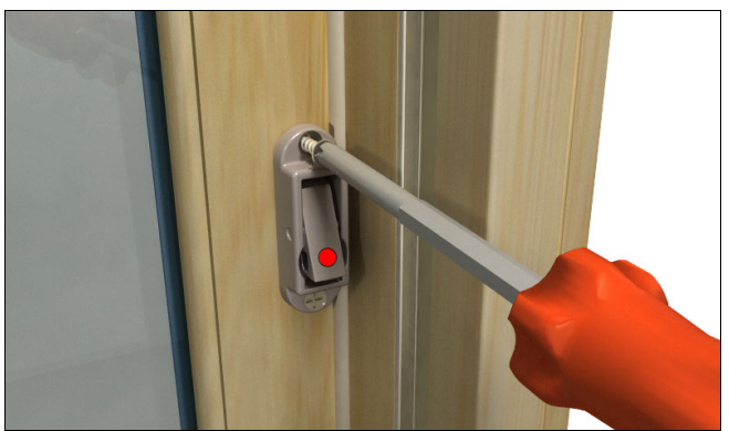
Figure 3 Orient the flipper on the control device as shown.

NOTE: The word "UP" is etched into the back side of the Control Device and should be installed facing toward the stile.