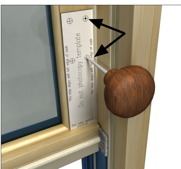
Figure 1 See template (UDH shown) on the bottom of page 3.

You must pre-drill holes prior to installation.