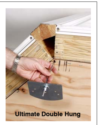
UDH sill shown for illustrative purposes