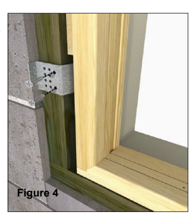
Signature Structural Masonry Bracket Supplemental Installation Instruction

4. Bend bracket around the interior framing and drill two 5/32"(4) holes side by side the through masonry bracket. Proceed with installing the unit as detailed in the unit installation See instructions. figure 4.