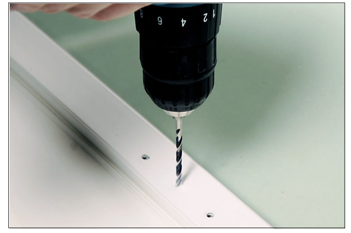
Figure 3: Drill hole to access backer.

4. Pry on the backer with a sharp scratch awl to move it over slightly. Then install the new sash lift. See figure 4.