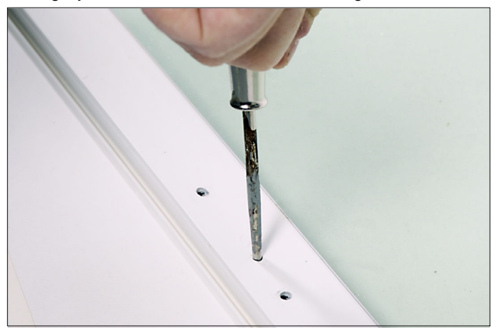
Figure 4: Use scratch awl to move backer.

4. Pry on the backer with a sharp scratch awl to move it over slightly. Then install the new sash lift. See figure 4.