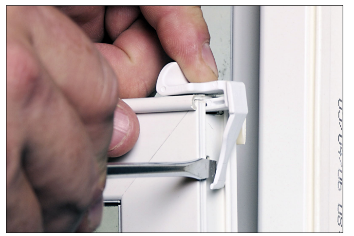
Figure 1: Remove old tilt latch with a screwdriver.