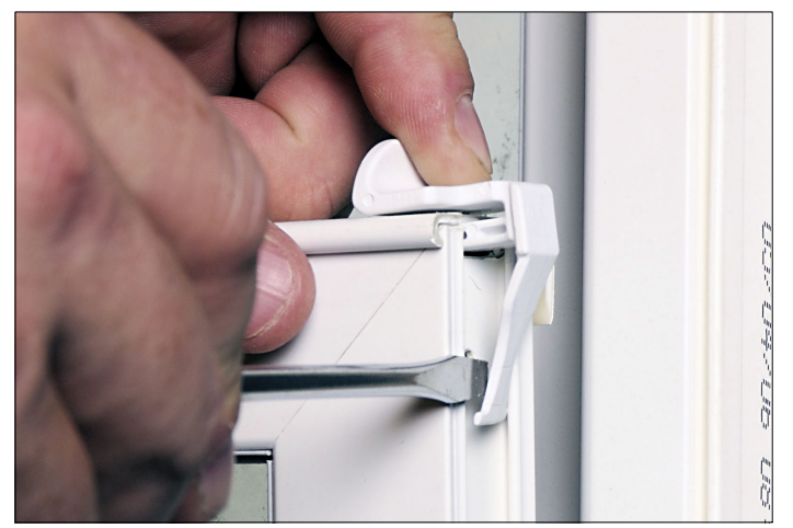
Figure 1: Remove old tilt latch with a screwdriver.