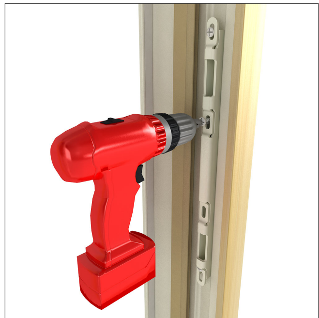
Figure 4 Fasten the new keeper. Refer to the product's installation instructions for more details on handle installation.