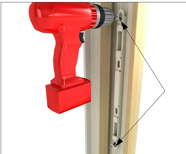
Figure 2 Fasten the new keeper by lining up the existing top and bottom screw slots.