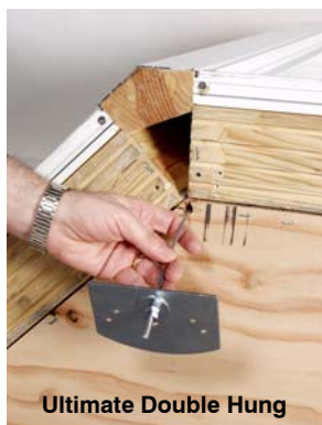
Ultimate Double Hung

UDH sill shown for illustrative purposes